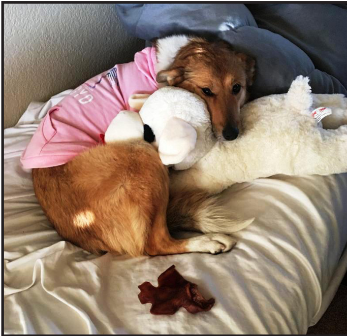
Remy feels more secure every day!

Clyde is a small collie, AND... he's underweight. But he's a typical collie... and loves to eat, so we're working on getting him to his optimum weight. And, not surprisingly, the more he eats, the more he wants to walk, run, and play!