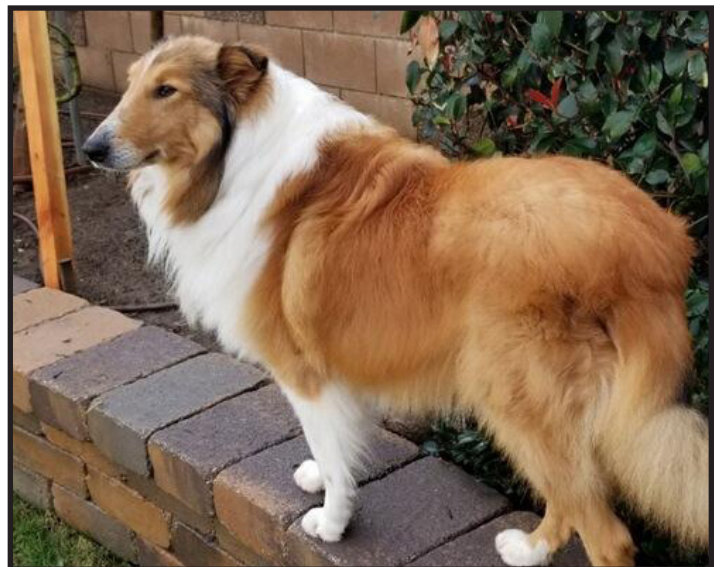
Duncan has become a very handsome boy!