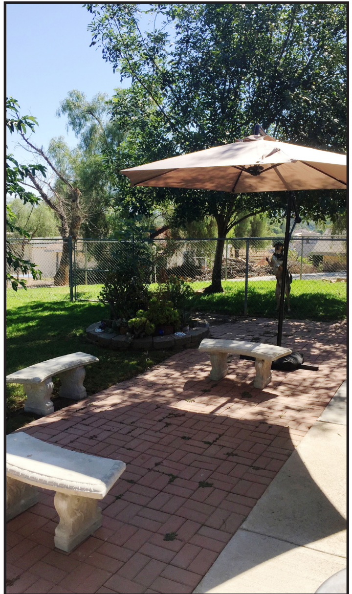
The Grace M. Muir Memorial Collie Garden